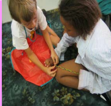
Year 1s at work— making and exchanging friendship bracelets