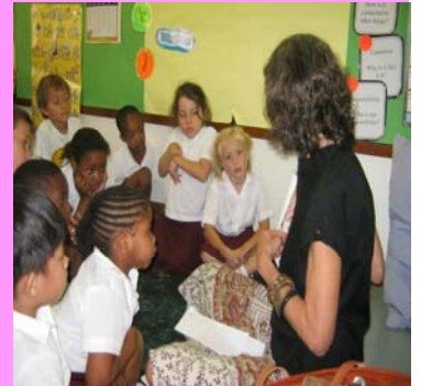
Mystery Boxes - counting and classifying into one or more attributes.