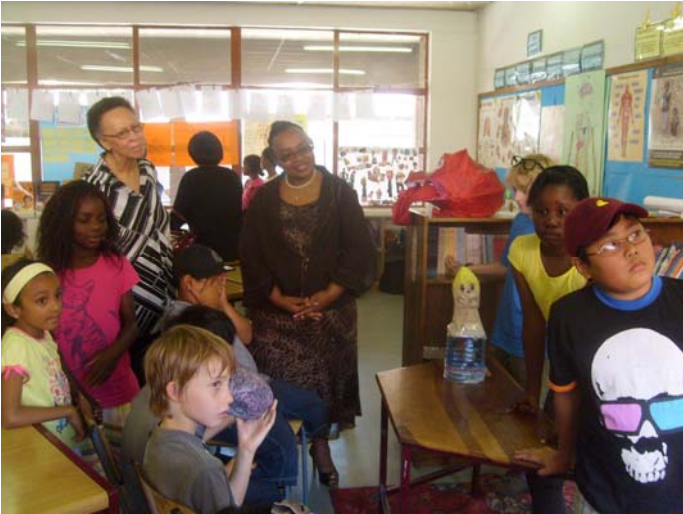
Part of the attendees following through the presentations