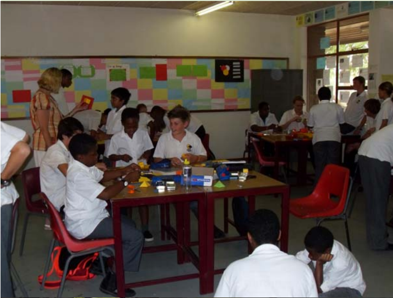
Y5 and Y10 students made nets together in Maths