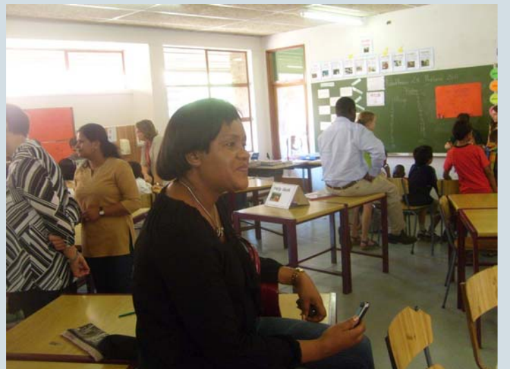
Some parents recorded the presentations!