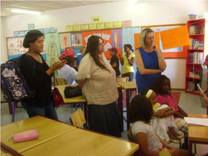
Enthusiastic parents watching the demonstrations