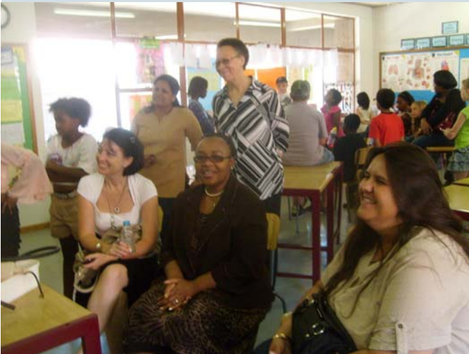
Another group of enthusiastic listeners!