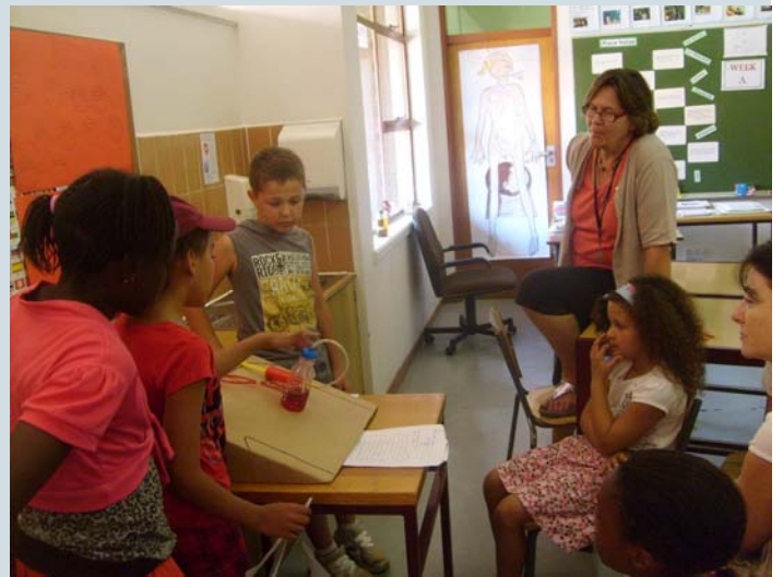
Demonstrating how the circulatory system works.