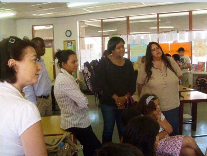
All ears and eyes on the presenters.